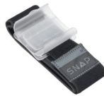
for 3M™ Snap™ Plus Therapy System