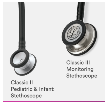
Classic II Pediatric & Infant Stethoscope

Ideal for taking blood pressure readings and making limited patient assessments.