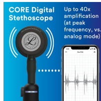
CORE Digital Stethoscope

Provides outstanding acoustic sensitivity to help you perform detailed diagnostic auscultation. Useful in challenging and critical care environments.