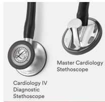
Cardiology IV Diagnostic Stethoscope

Hard-working, dependable, clinical tools for physical assessment and monitoring of your patients, one long shift after another.