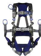
Oil and Gas