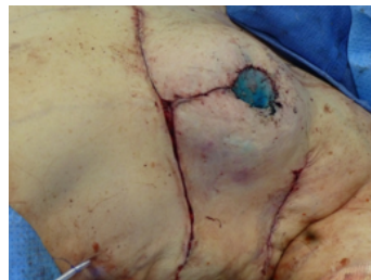
Figure 2. Blue coloring of the left nipple during breast reduction surgery, secondary to indocyanine blue injection and venous congestion.