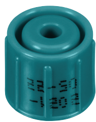
3M™ CuROS™ Stopper Disinfecting Cap for open female luers