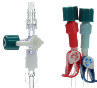
Open female luers (stopcocks or catheter hubs)