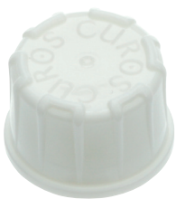
3M™ CuROS™ Disinfecting Cap for Tego® Hemodialysis Connectors