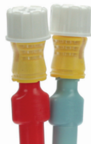
Tego® Hemodialysis Connectors