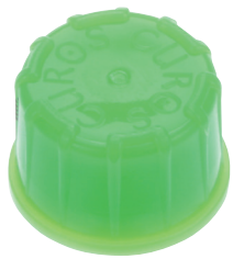
3M™ CuROS™ Disinfecting Cap for needleless connectors