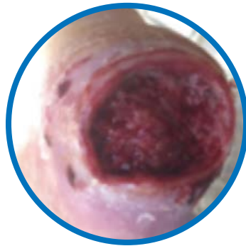
Calcaneal Diabetic Foot Ulcer