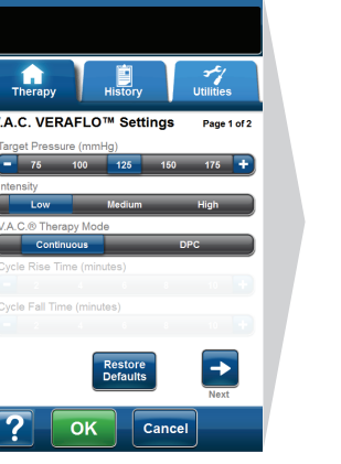
Adjust pressure, intensity and therapy mode. Select OK to accept settings.