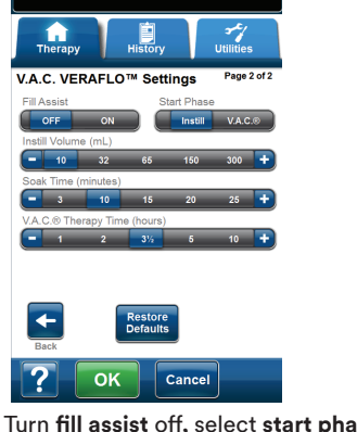
Turn fill assist off, select start phase. Adjust instill volume, soak time and V.A.C.<sup>®</sup> Therapy time.