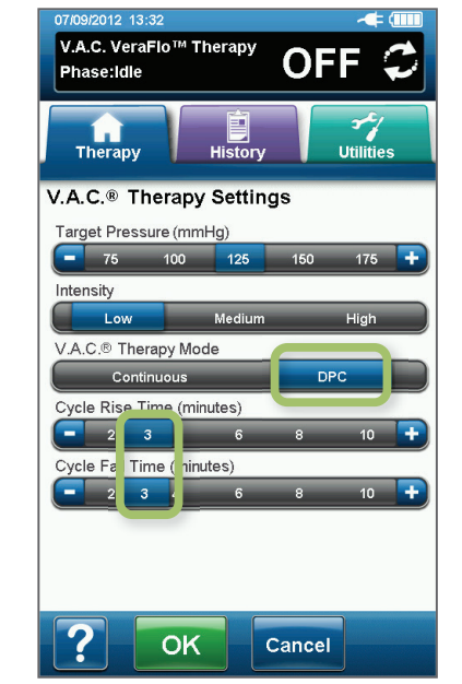
Configure V.A.C Therapy as prescribed and select OK .

V.A.C.<sup>®</sup> Therapy advanced settings screen.