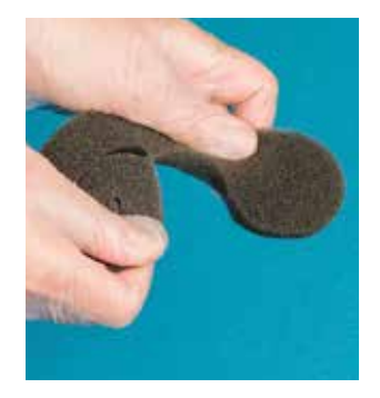
6. Gently place the foam into the wound cavity ensuring contact with all wound surfaces. Do not pack the dressing into the wound. Always count the number of foam pieces placed in the wound. Record on the Foam Quantity Ruler and place in the patient record.

5. Carefully tear the V.A.C.<sup>®</sup> Simplace<sup>™</sup> Ex dressing along the perforation to a size that will allow the foam to be placed gently into the wound without overlapping onto intact skin. Do not cut the foam over the wound as fragments may fall into the wound.