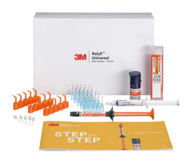
3M™ RelyX™ Universal Resin Cement Trial Kit TR (56969)