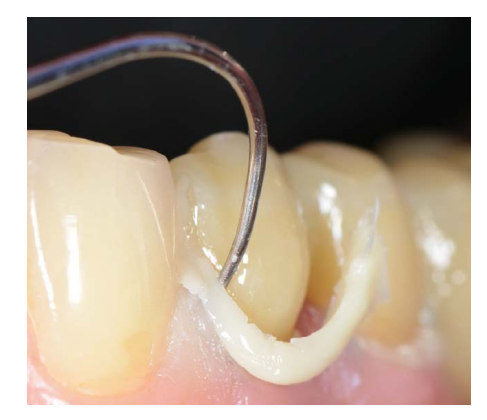
Self-adhesive cementation of a 3M™ Lava™ Esthetic Fluorescent Full-Contour Zirconia bridge: Image courtesy of Dr. Jan Gueth.

Efficient to the last step. Its unique chemistry ensures excess outflow stays put at the restoration margins, and can be easily removed after tack curing.