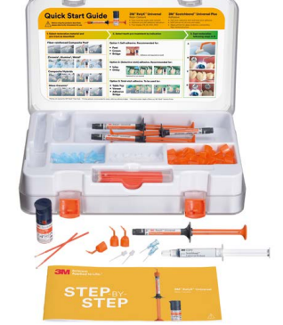
3M™ RelyX™ Universal Resin Cement Intro Kit (56968)