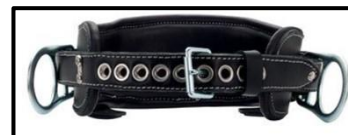
2D Lineman Tongue Buckle Body Belt

As part of 3M Fall Protection’s continued commitment to producing high quality safety and personal protective equipment, we conduct periodic testing of our products. Recent testing of specific 3M™DBI-SALA® Delta™ Seat Belt™ 2D & 4D Lineman Belts (see pictures to right) has returned unfavorable test results on some units. These Lineman Belts are certified to a variety of standards but specifically this recall applies to the compliance with the Canadian Standards Association (CSA) Z259.1-05 Section 6.2 and ASTM F887-13. This section requires the belt system to be dynamically tested to ensure the last tongue buckle belt grommet will hold up in a misuse situation or accident involving only one D-ring being connected. In recent internal testing, some of these models did not meet this dynamic test requirement. Because they are marked as meeting the CSA and ASTM F887-13 standards and we experienced the recent non-passing tests, 3M Fall Protection is issuing a recall for specific 2D and 4D models (see part numbers listed below) manufactured between Sept. 19, 2019 and June 30, 2020.