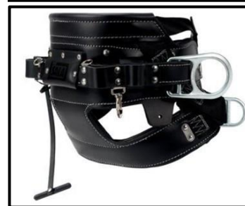
4D Lineman Tongue Buckle Body Belt

Please note: these 3M™ DBI-SALA® 2D & 4D Lineman Belts do meet the test procedures stated in OSHA 1926 Subpart “M”, Appendix “D”.