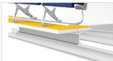
3M™ Polyurethane Protective Tape for wide area protection

The tapes come in two widths, ensuring complete protection: