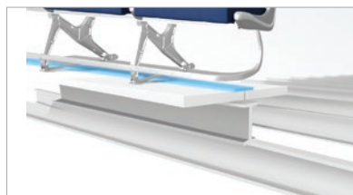
3M™ Polyurethane Protective Tape for seam sealing