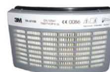
TR-3802E PAPR-P3 with nuisance* OV