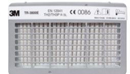
TR-3822E PAPR-P3 with nuisance* AG