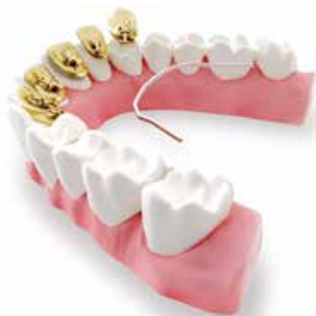
3M™ Incognito™ Lite Appliance System