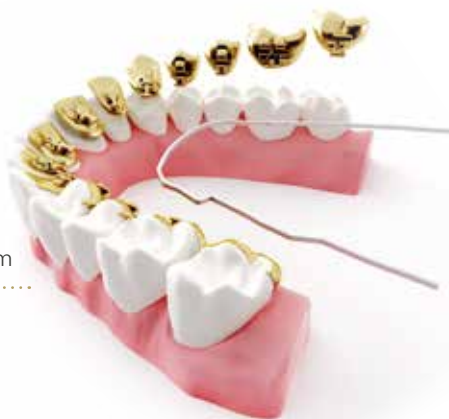
3M™ Incognito™ Appliance System