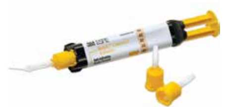
3M™ RelyX™ Unicem 2 Automix Self-Adhesive Universal Resin Cement