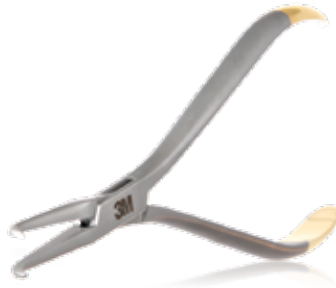
Unitek Lingual Weingart Utility Pliers with 60° Bend