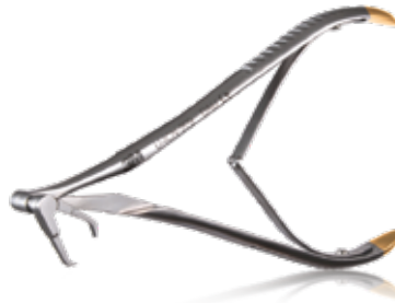
Unitek Lingual Anterior Debonding Pliers