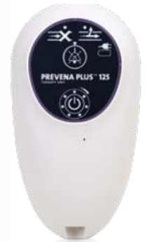
PREVENA PLUS™ 125 Therapy Unit