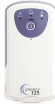
PREVENA™ 125 Therapy Unit

PREVENA™ Therapy is the only medical device indicated by the FDA to aid in the reduction of the incidence of seroma, and in high risk patients, aids in the reduction of superficial surgical site infection in Class I and II wounds.