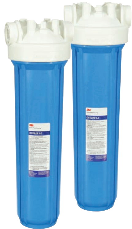
3M™ CFS22B 1.0 / CFS22B 1.5 Series Housing