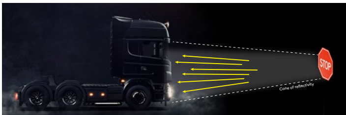
High Intensity Prismatic: Less light reflected from sign; most striking truck below the driver's eye.

Unlike sheeting that uses truncated cube technology that has an active area of 67% or less, DG 3 utilizes 100% active area full-cube technology.