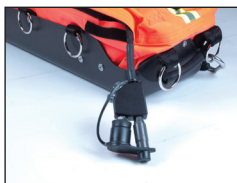
Low-Pressure Hose and Dual Manifold (with Hansen or Rectus fittings)