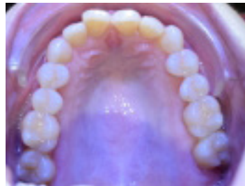
Occlusal – Maxillary (initial)