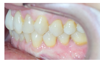
Retracted Buccal (initial)