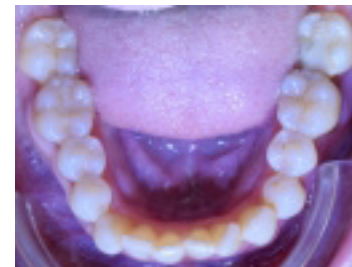
Occlusal – Mandibular (initial)