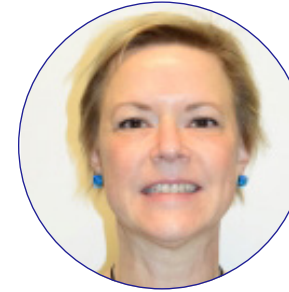
Face smiling (initial)