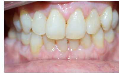
Retracted anterior biting (initial)