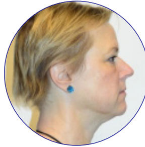
Profile at rest (initial)