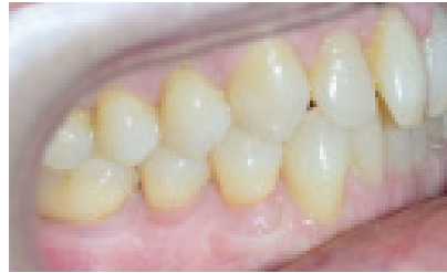
Retracted Buccal (initial)