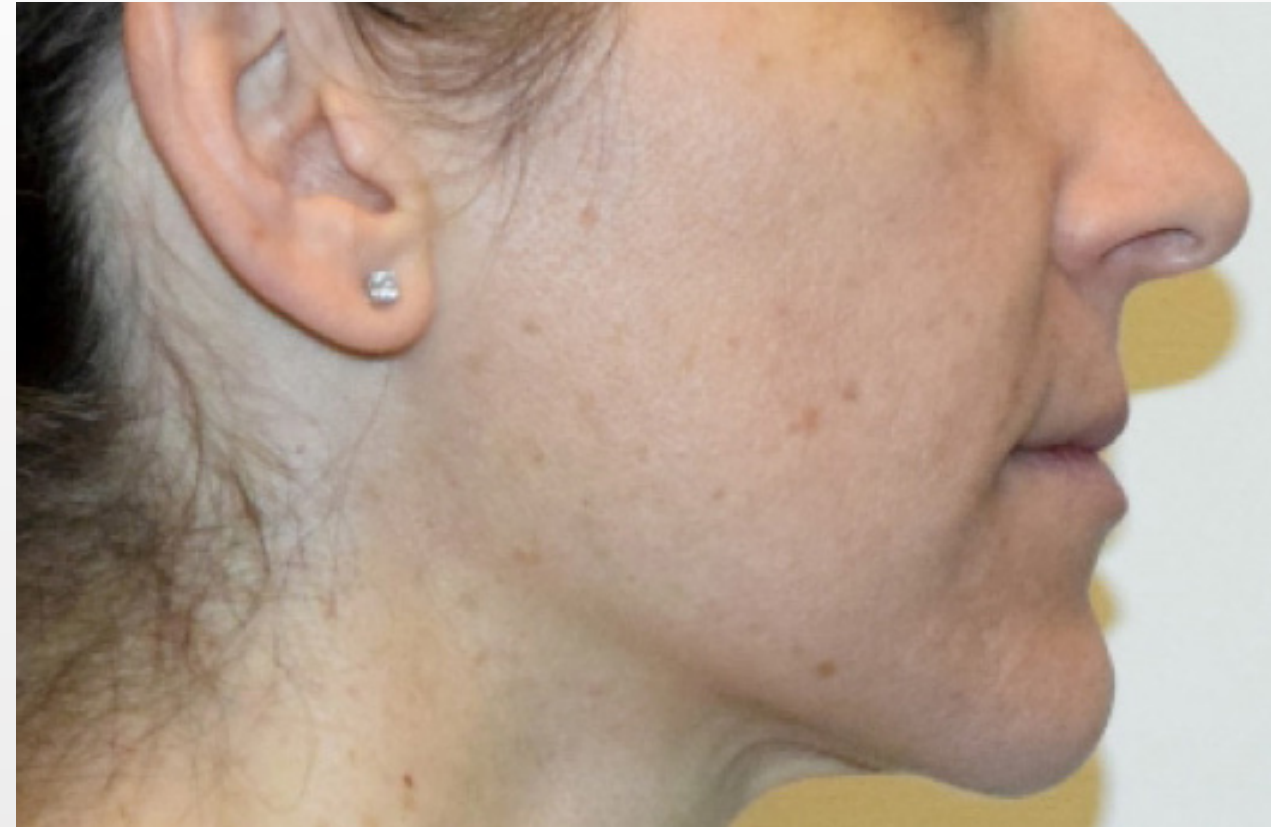
Profile at rest