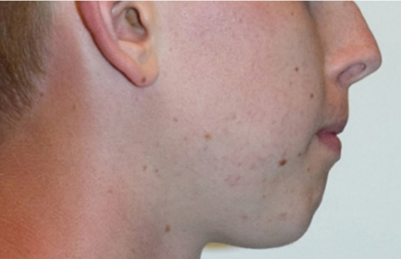
Profile at rest