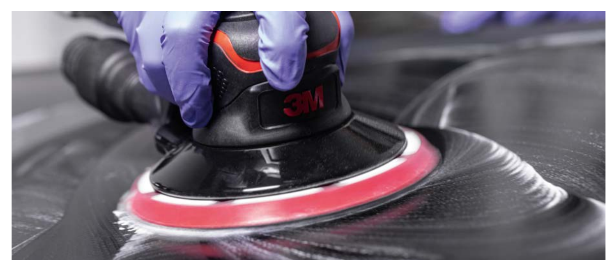
► Sand the area with 3M<sup>™</sup> Trizact<sup>™</sup> Fine Finishing Disc 443SA, grade 3000, 150 mm on orbital sander.

► Scratch refinement with 3M<sup>™</sup> Trizact<sup>™</sup> Fine Finishing Disc