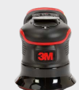
3M™ Precision Random Orbital Sander 75 mm (3 in)