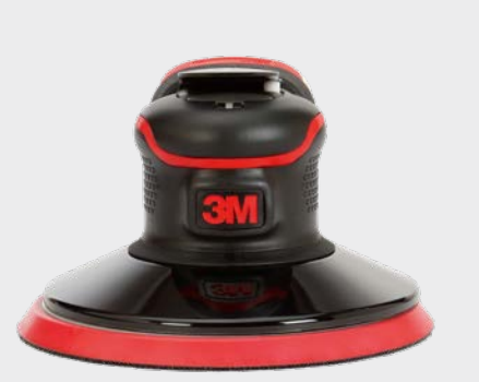
3M™ Precision Random Orbital Sander 150 mm (6 in )