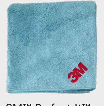
3M™ Perfect-It™ High Performance Cloth