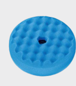
3M™ Perfect-It™ Quick Connect Double Sided Convoluted Blue Polishing Pad