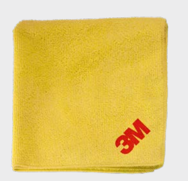
3M™ Perfect-It™ High Performance Cloth