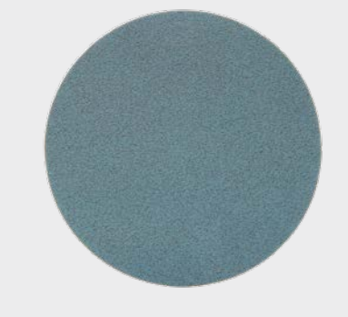
3M™ Trizact™ Fine Finishing Disc 5000, 150 mm