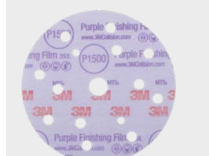
3M™ Hookit™ 260L+

► Sand the area with 3M<sup>™</sup> Hookit<sup>™</sup> Purple Finishing Film Abrasive Disc 260L, grade P1500 - P2000.