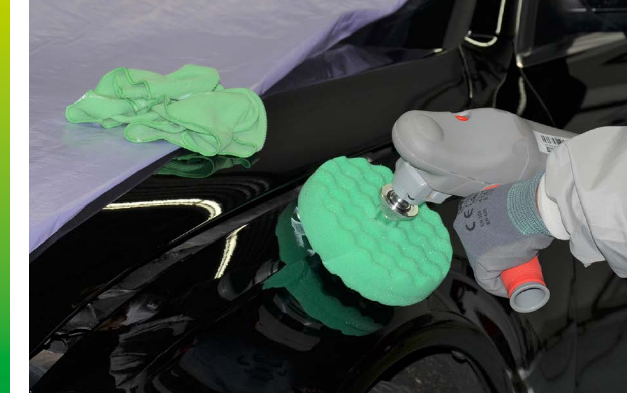
► Add a small amount of 3M<sup>™</sup> Perfect-It<sup>™</sup> Fast Cut Plus Extreme onto the green foam pad on the rotary polisher.