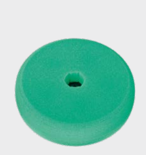
3M™ Perfect-It™ Quick Connect Double Sided Flat Green Polishing Pad