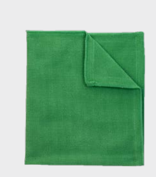
3M™ High Performance Cloth