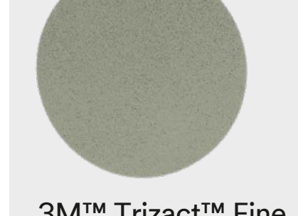
3M™ Trizact™ Fine Finishing Disc 3000,

► Scratch refinement with 3M<sup>™</sup> Trizact<sup>™</sup> Fine Finishing Disc