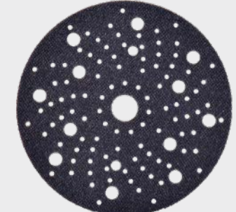
3M™ Hookit™ Interface-Pad Multihole