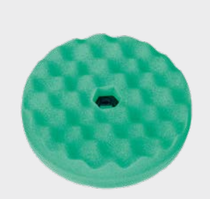
3M™ Perfect-It™ Quick Connect Double Sided Convoluted Green Polishing