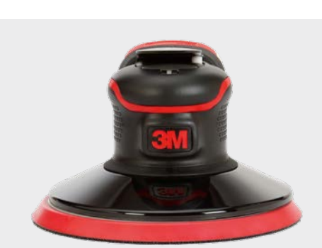
3M™ Precision Random Orbital Sander 150 mm (6 in )