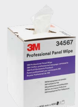
3M™ Professional Panel Wipes