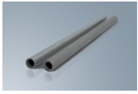
3M™ Silicon Carbide Thermocouple Protection Tubes for extreme environments

Thermocouple protection tubes made of 3M™ Silicon Carbide Grade F (SSiC) show an excellent performance under corrosive and abrasive conditions and very high temperatures. 3M™ Silicon Carbide Thermocouple Protection Tubes provides absolute gas impermeability and high purity of > 99 % SiC at the same time.