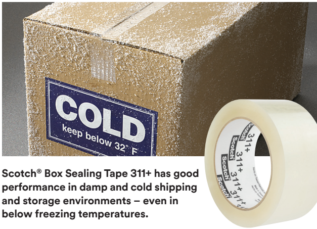
Scotch® Box Sealing Tape 311+ has good performance in damp and cold shipping and storage environments – even in below freezing temperatures.