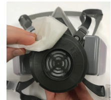
Exhalation Valve Filter 604