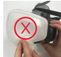
5N11 Filter Assembly