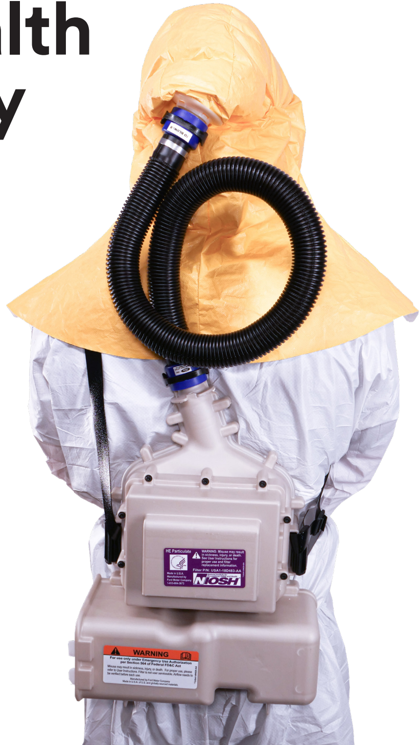
PAPR system being worn by worker