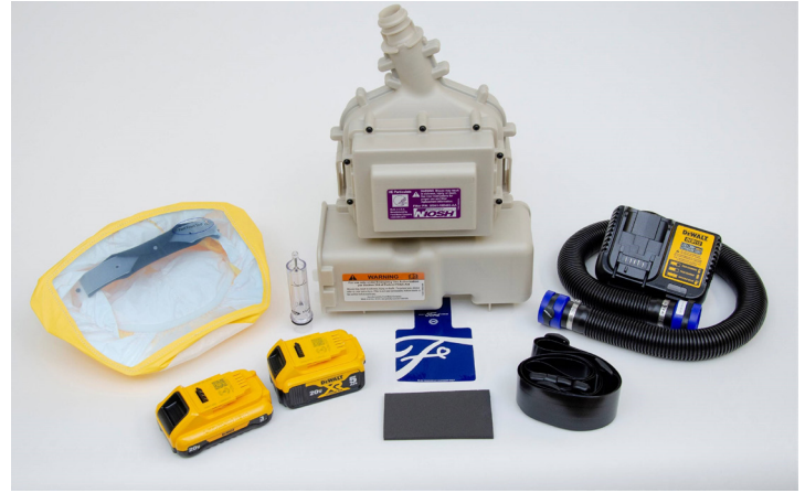
Ford® Limited-Use Public Health Emergency PAPR Kit

Limited-Use Public Health Emergency PAPR vs. 3M™ Versaflo™ TR-300+ PAPR