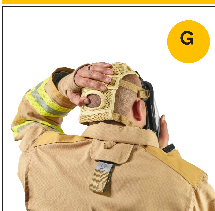
Smooth the head harness down the back of the head and make sure the net is flat against the head. If necessary, adjust the bottom of the head harness to sit below the crown of the head.

Verify that the head harness is centered on the crown of the head and lying flat against the back of the head.