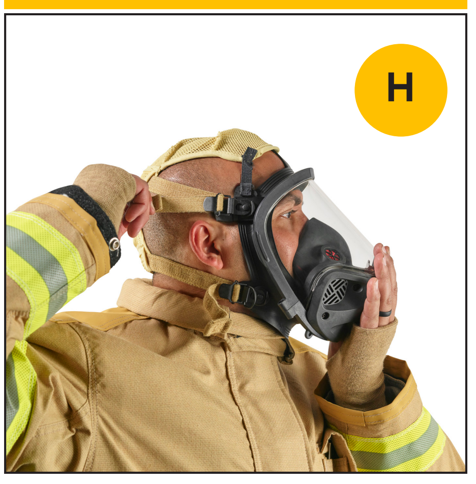
Once again, verify the proper location of the face in the facepiece and the chin in the chin cup.

Re-tighten the straps. All straps must be snug and the facepiece should feel secure.