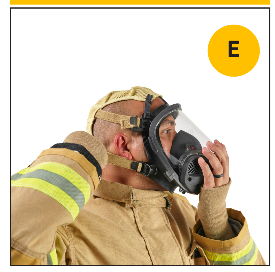
While holding the facepiece in place with one hand, tighten the neck straps evenly one at a time by pulling each neck strap end toward the rear of the head. Alternate hands to maintain the facepiece position on the face. See Figure E.