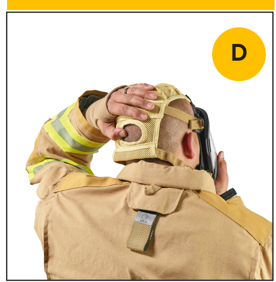
Smooth the head harness over the head and ensure that straps are lying smooth and flat against the head and neck with no twists.

Verify the head harness is centered and properly located at the back and base of the head. Maintain the head harness in this position. See Figure D.