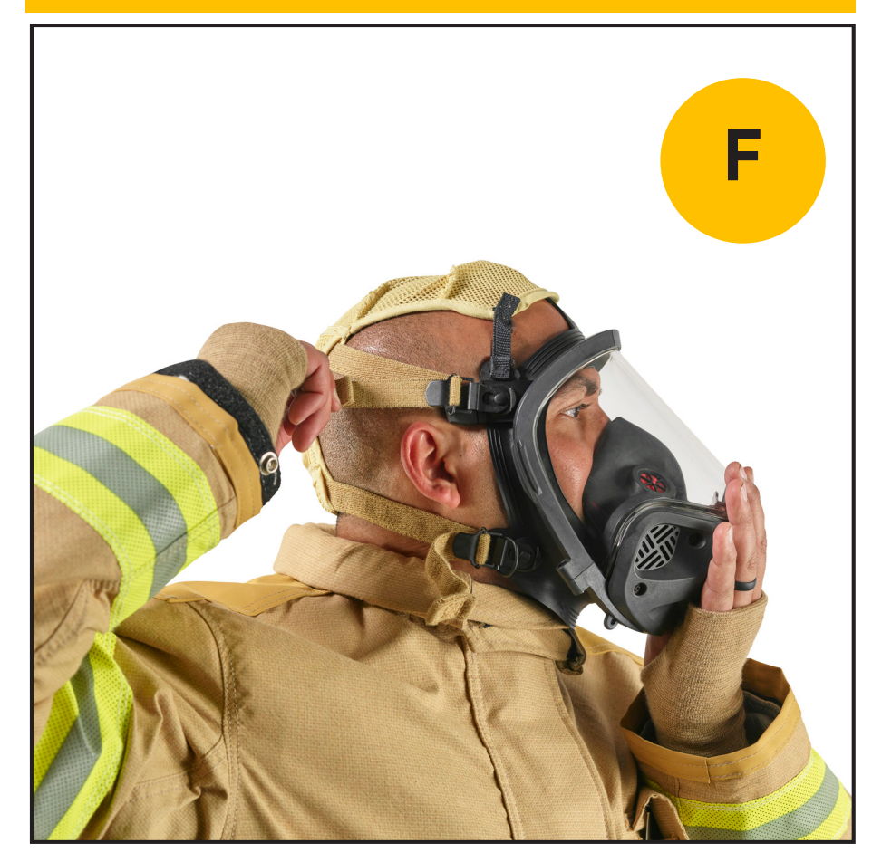
Verify the proper location of the face in the facepiece and the chin in the chin cup. While still holding the facepiece in place with one hand, tighten the temple straps evenly one at a time by pulling each temple strap end toward the rear of the head. Alternate hands to maintain the facepiece position on the face. See Figure F.