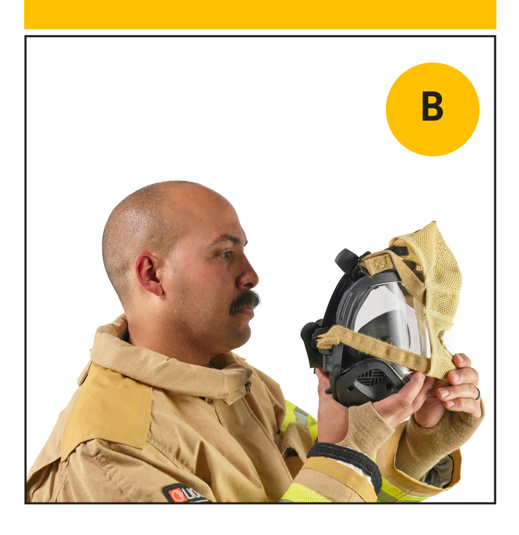
Hold the facepiece in one hand. Fold the head harness over the lens (see figure B), or hold the head harness up and out of the way with the other hand.