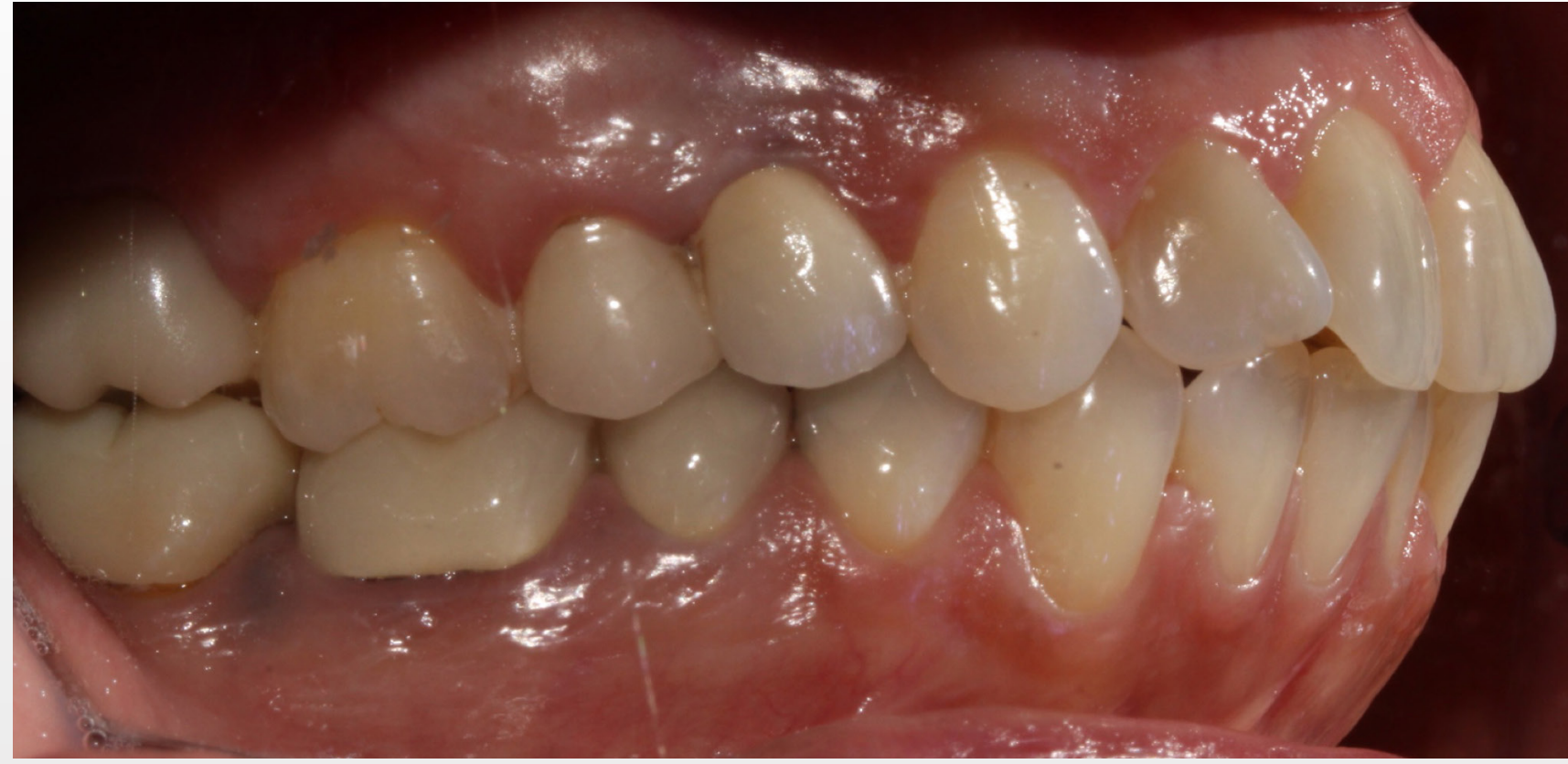
Retracted buccal – right