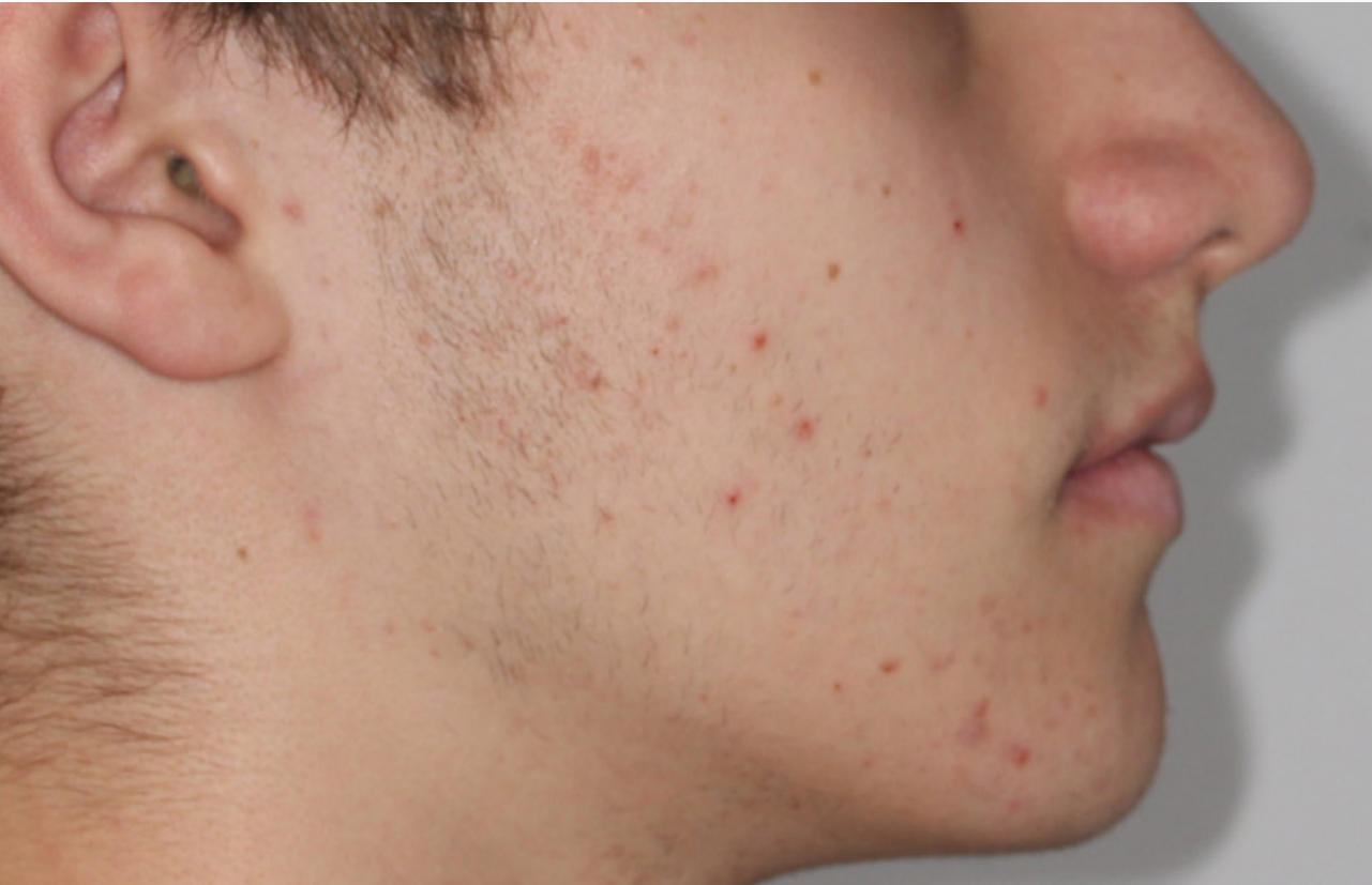
Profile at rest