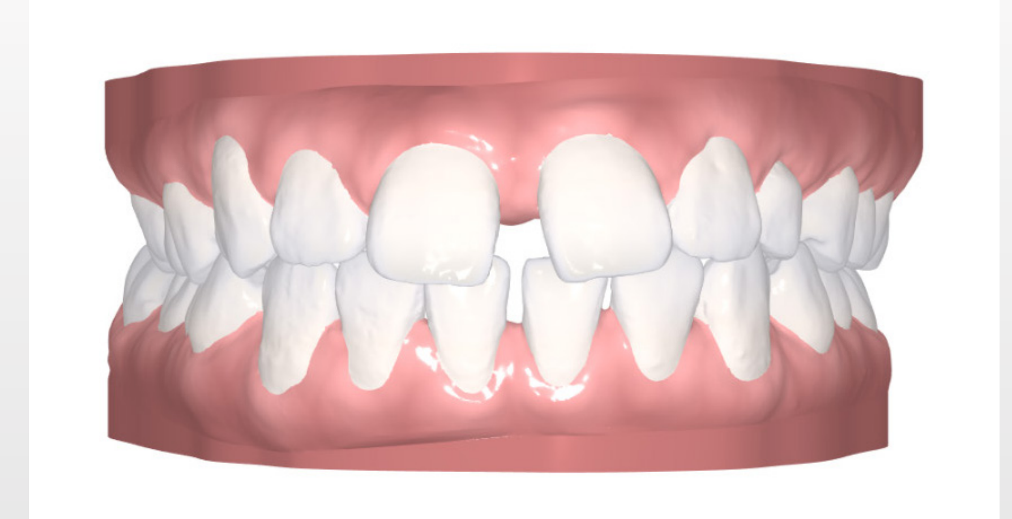
Tx design Anterior open