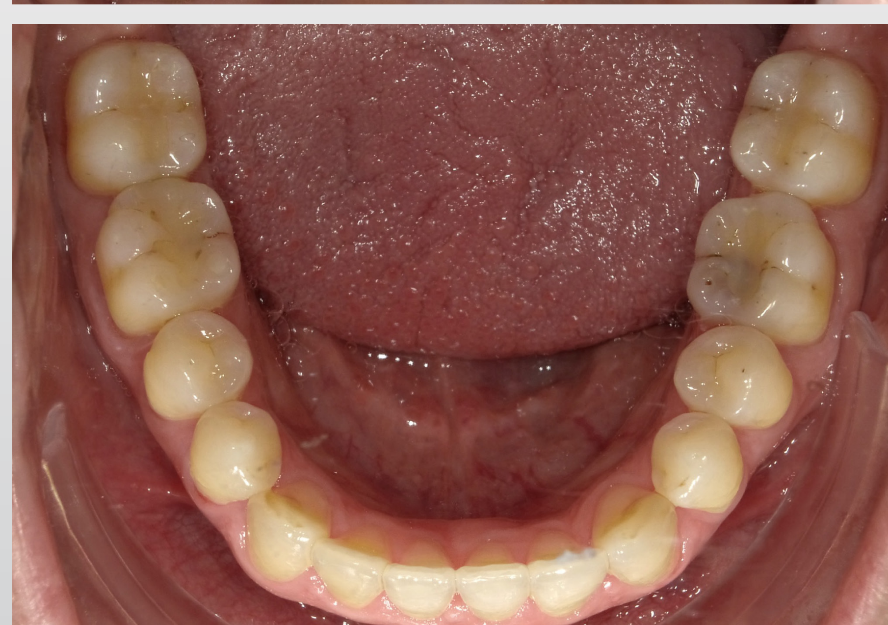
Occlusal – mandibular