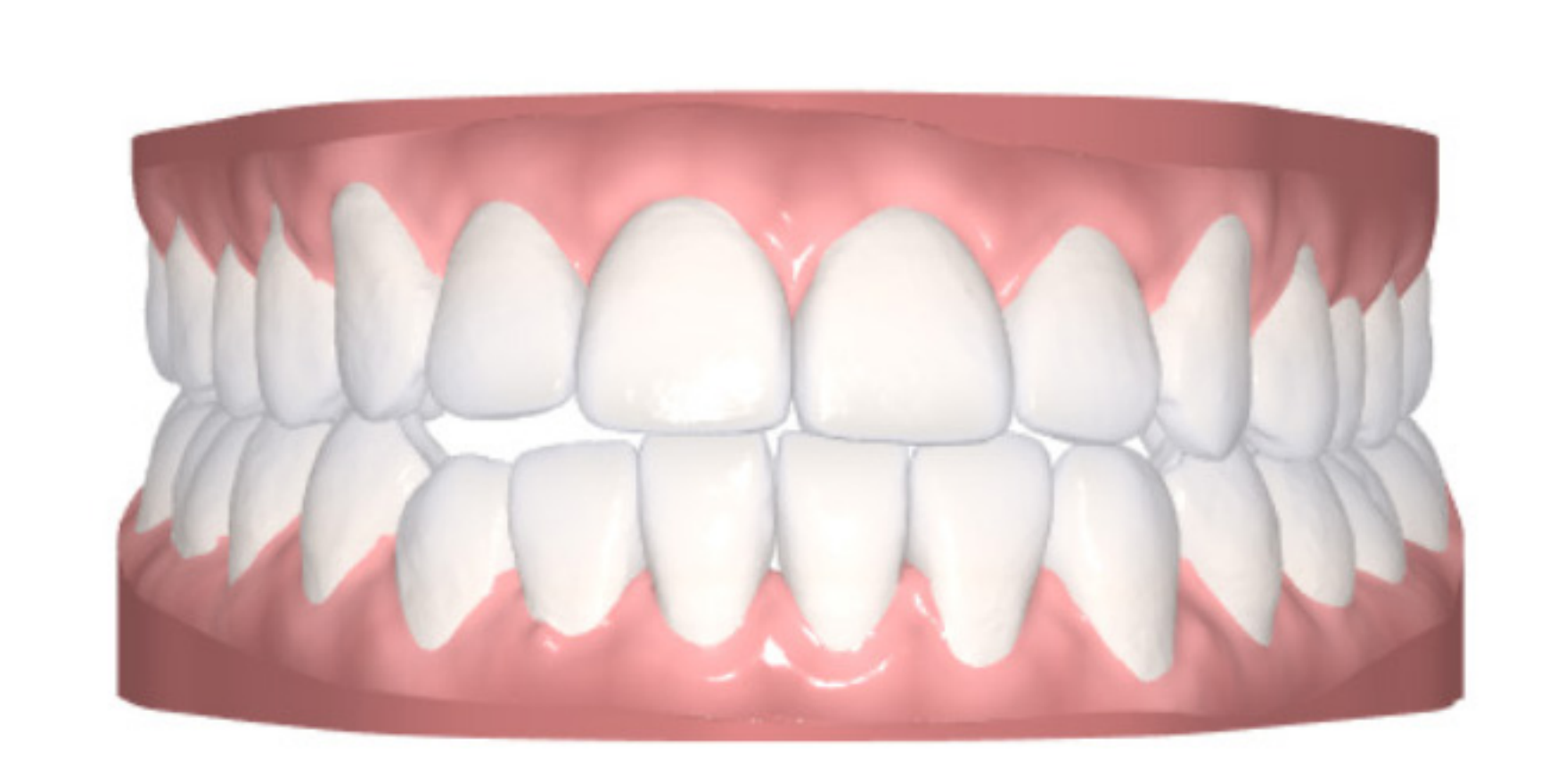
Tx design Anterior open