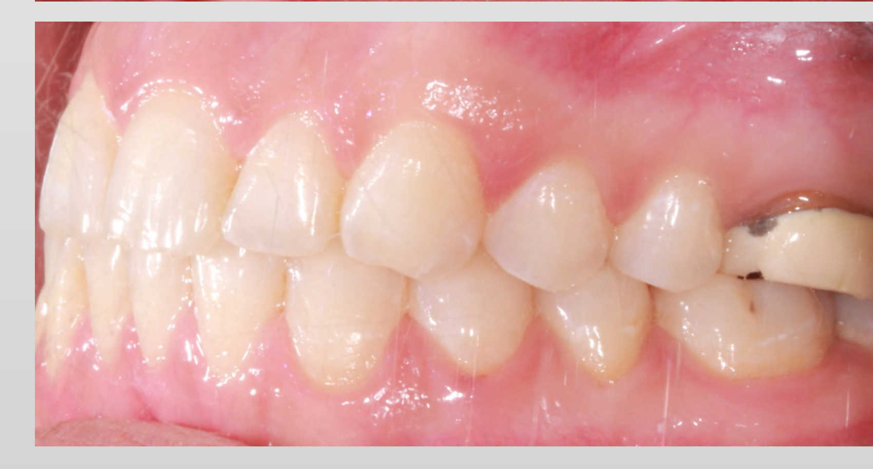
Retracted anterior biting