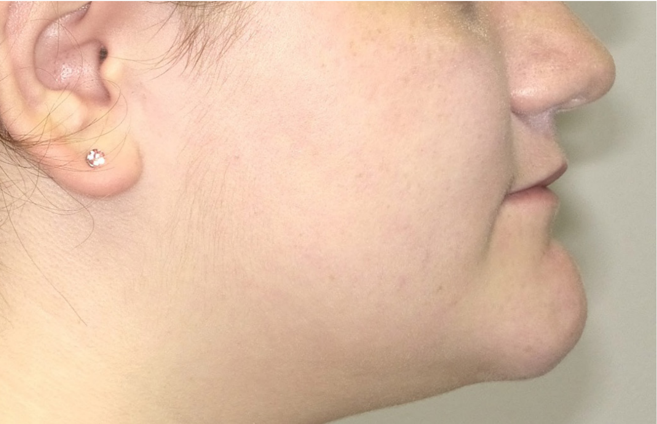
Profile at rest