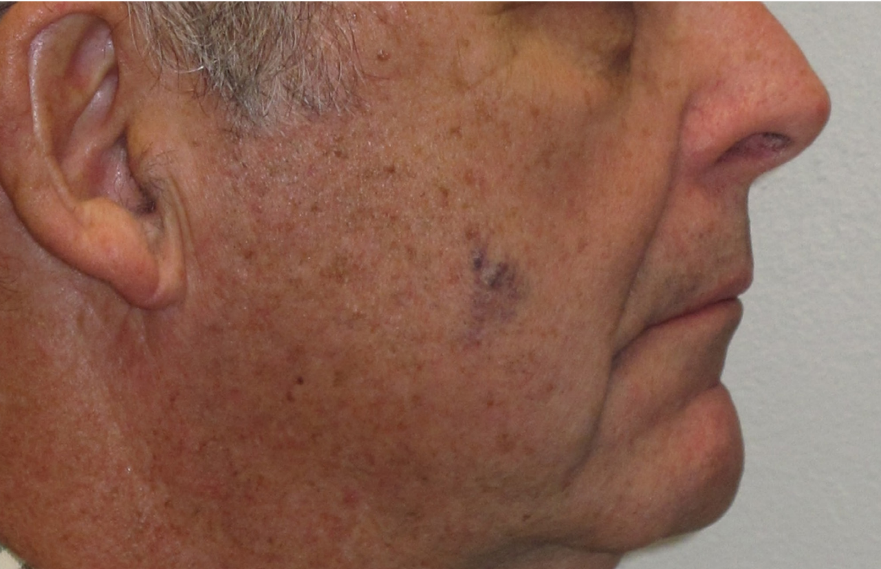
Profile at rest