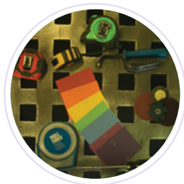
9002NC ADF Shade 3

Improved optics in the Speedglas™ welding filter 9002NC helps you see your welds in a new light, providing more contrast and natural-looking colour as shown in these photos.