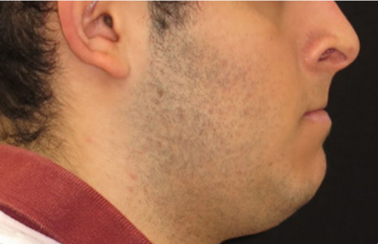
Profile at rest