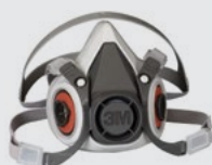
6000 Half Face