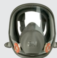
6000 Full Face