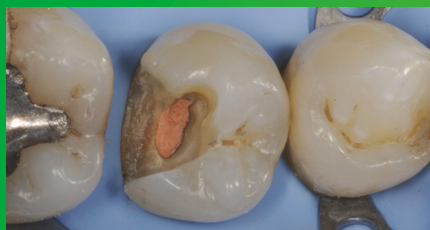
Fig. 1: Initial Situation: Second lower right premolar with a deep carious lesion restoration that required endodontic treatment. Image is showing the final preparation after removing the temporary filling.