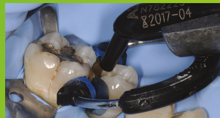
Fig. 6: 3M™ Filtek™ One Bulk Fill Restorative, in shade A3, is directly placed into the cavity in a single increment and then cured according to the Instructions for Use.