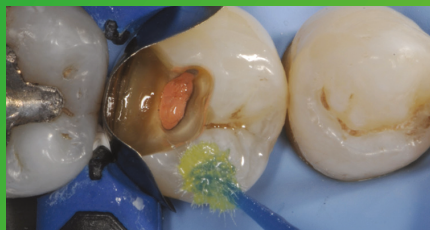
Fig. 4: 3M™ Scotchbond™ Universal Adhesive is applied and scrubbed into the surface for 20 seconds.