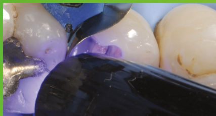
Fig. 5: After air drying for approximately 5 seconds, the adhesive is light cured for 10 seconds with 3M™ Elipar™ DeepCure-S LED Curing Light.