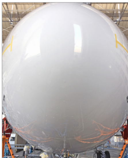
Protective boot installation on radome with internal static diverters.