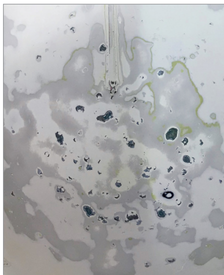
Close up view of damaged radome flown without protective boot installed.