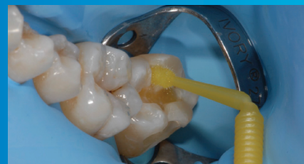
Fig. 3: After selective enamel etching, Single Bond Universal Adhesive was applied.