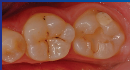
Fig. 1: Initial situation: mandibular second molar with restorations require replacement.