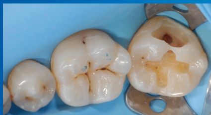
Fig. 2: After placement of rubber dam the insufficient fillings were completely removed.