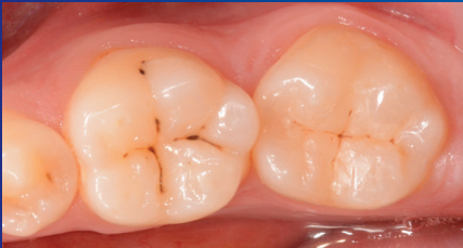
Fig. 10: Final restorations with an excellent esthetic appearance.