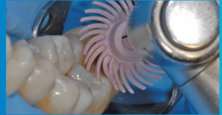
Fig. 9: After pre-polishing was complete, the restoration was brought to a high gloss polish with Sof-Lex™ Diamond Polishing Spiral.