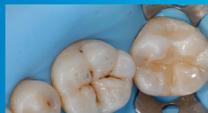
Fig. 6: Dentin was replaced with incremental placement and curing of Filtek™ Z350 XT Universal Restorative, shade A3B.