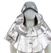
3M™ Radiant Heat Cover M-973 for M-300