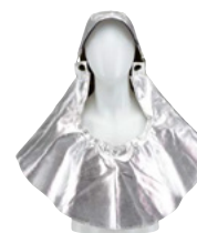
3M™ Radiant Heat Cover M-975 for M-400