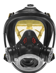
3M™ Scott™ AV-3000 HT facepiece