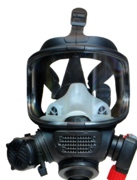
3M™ Scott™ Promask facepiece