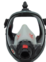
3M™ Scott™ Vision AMS facepiece