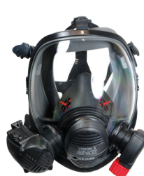
3M™ Scott™ Vision 3 facepiece