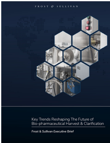
Key Trends Reshaping The Future of Bio-pharmaceutical Harvest and Clarification

See more white papers from Frost & Sullivan and stay connected with industry expert news. 3M will keep you up to speed on innovative material science technologies. Click on the link below to join our email subscription.