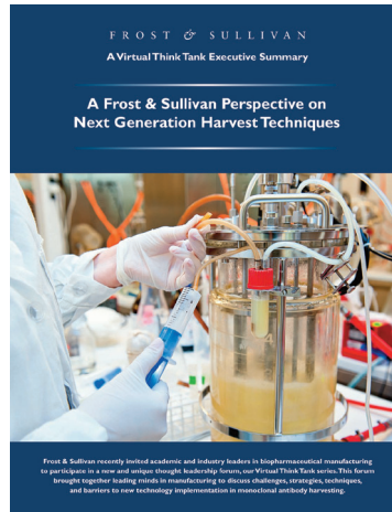
Perspective on Next Generation Harvest Techniques