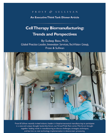
Cell Therapy Biomanufacturing: Trends and Perspectives