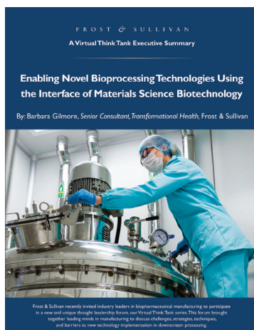
Enabling Novel Bioprocessing Technologies Using the Interface of Materials Science Biotechnology