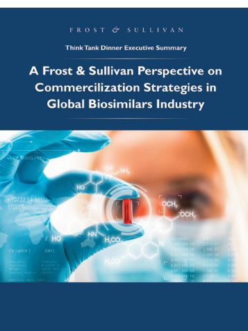
Commercialization Strategies in Global Biosimilar