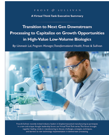
Transition to Next Gen Downstream Processing to Capitalize on Growth Opportunities in High-Value Low-Volume Biologics