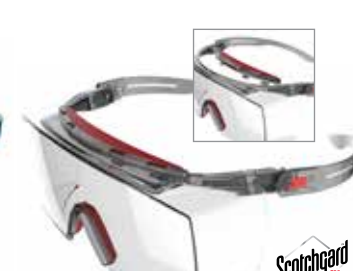
SF3701XSGAF-RED Lens: Clear Frame Color: Gray/Gray