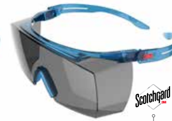
SF3702SGAF-BLU SF3702AS-BLU Lens: Gray Frame Color: Blue/Blue