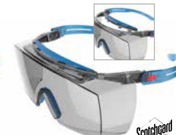
SF3707XSGAF-BLU Lens: I/O Gray Frame Color: Gray/Blue