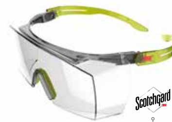
SF3701SGAF-GRN SF3701AS-GRN Lens: Clear Frame Color: Gray/Lime Green