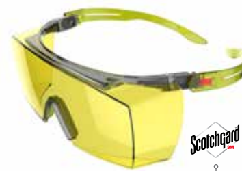
SF3703SGAF-GRN Lens: Amber Frame Color: Gray/Lime Green