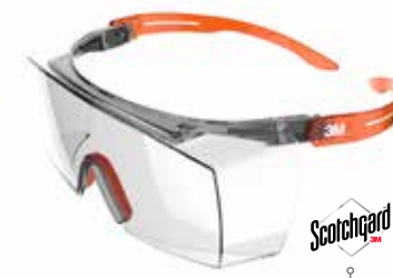
SF3701SGAF-ORG SF3701AS-ORG Lens: Clear Frame Color: Gray/Orange