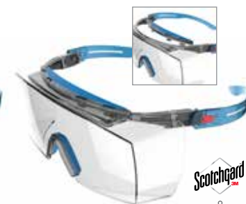
SF3701XASGAF-BLU Lens: Gray Frame Color: Gray/Blue