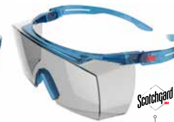
SF3707SGAF-BLU SF3707AS-BLU Lens: I/O Gray Frame Color: Blue/Blue