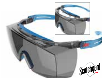
SF3702XSGAF-BLU Lens: Gray Frame Color: Gray/Blue