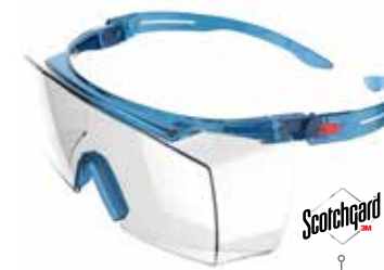
SF3701SGAF-BLU SF3701AS-BLU Lens: Clear Frame Color: Blue/Blue