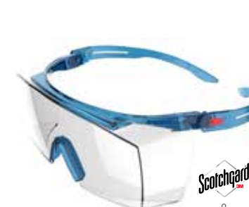
SF3701ASGAF-BLU Lens: Clear Frame Color: Blue/Blue