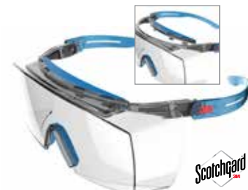
SF3701XSGAF-BLU SF3701XAS-BLU Lens: Clear Frame Color: Gray/Blue