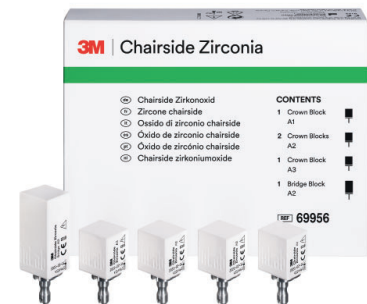
3M™ Chairside Zirconia Intro Kit (69956)

3M and RelyX are trademarks of 3M Company or 3M Deutschland GmbH. Printed in USA. All other trademarks herein are the property of their respective owners. © 3M 2021. All rights reserved. 70-2013-7396-9