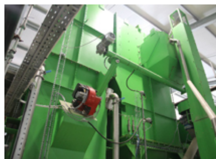
Fluidised bed biomass boiler

The E-RATIONAL ORC at the Glenhead of Aldouran farm has been designed to maximise uptime and efficiency with a minimised operational and maintenance cost. The containerised modular machine is CE-compliant, with plug-and-play connections for easy installation at the farm. The ORC machines from E-RATIONAL can convert heat from various sources, such as industrial processes, or utilise unused excess heat from district heating networks. In the case of the farm, it’s the chickens’ own waste that is converted into keeping them warm, a virtuous ‘circular economy’ approach that is sure to give other farms inspiration for their own waste management.