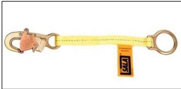
3M ID 70007438503/3M DBI-SALA® PN 1231117

3M Fall Protection has received a series of inquiries regarding the use of dorsal D-ring extenders with Leading Edge SRL's in environments where sharp edges are present. Examples of 3M dorsal D-ring extenders are shown below, but the concern applies to all dorsal D-ring extenders, regardless of the supplier/manufacturer: