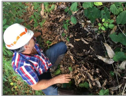
Team exploring outgrower (supplier of one of 3M's direct material providers) forest