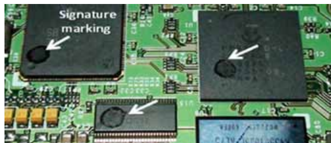
Figure 1. Examples of marking dark components with drops of Novec 1700 coating for identification of coated assemblies

For identification of a coated PCB on the assembly line, small dots of the coating solution can be put on black surface mount components (see Figure 1). The Novec 1700 coating marks on dark surfaces are obvious to the naked eye.