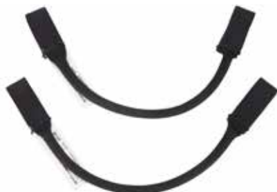
3M™ Protecta® Harness Gear Tool Loops

Tools can be secured while working at heights, to keep people and property safe anywhere below you – suitable for use with 3M Protecta Comfort Belt Harness models only.