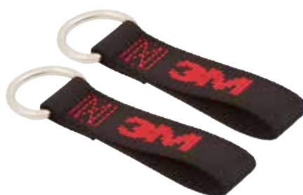
3M™ Protecta® Belt Loop D-Ring Tool Attachments

Tools can be secured while working at heights, to keep people and property safe anywhere below you – suitable for use with 3M Protecta Comfort Belt Harness models only.