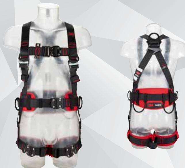
Comfort belt, horizontal leg straps