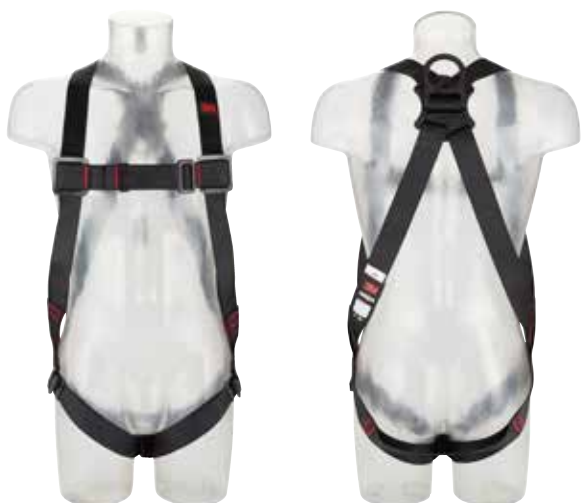
3M™ Protecta® Standard Vest Style Fall Arrest Harness