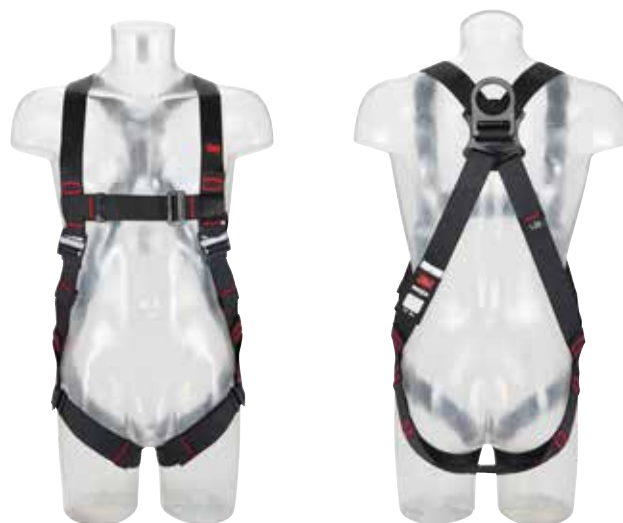
3M™ Protecta® Standard Vest Style Fall Arrest Harness