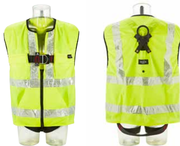
3M™ Protecta® Standard Vest Style Fall Arrest Harness with Hi-Visibility Vest