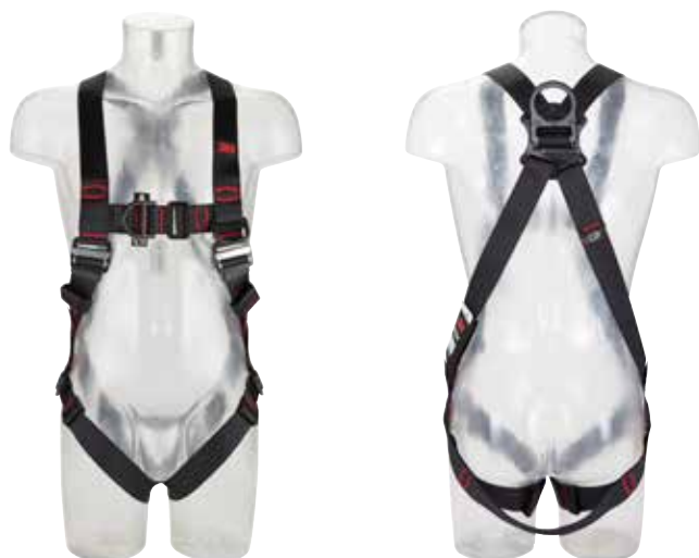
3M™ Protecta® Standard Vest Style Fall Arrest Harness