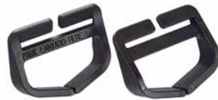
3M™ Protecta® Harness Lanyard Keepers

Auto-resetting lanyard keeper provides easy parking and release of snap hooks or carabiners.