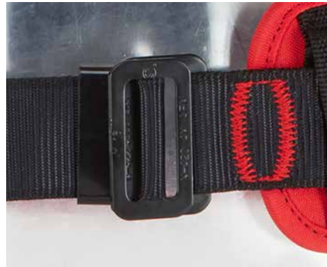
Pass through buckles