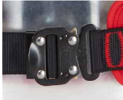
Quick connect buckles