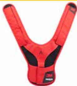
3M™ Protecta® Harness Comfort Shoulder and Back Padding

Comfortable, lightweight and breathable padding for better comfort and shoulder and back protection. Can be easily fitted or removed by the user. Suitable for all new 3M Protecta harness models.