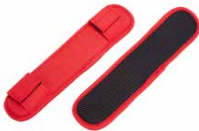
3M™ Protecta® Harness Comfort Leg Padding

Removable leg pads for additional comfort. Suitable for all new 3M Protecta harness models.