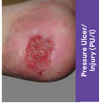
Pressure Ulcer/ Injury (PU/I)