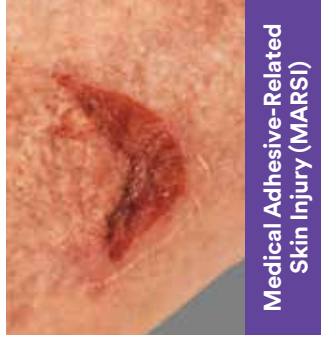
Medical Adhesive-Related Skin Injury (MARSi)

Caring for wounds is most definitely a science, but it's also an art. It's a job that requires specialized training and expertise, as well as instinct and intuition. At 3M, we partner with clinicians to develop wound care solutions that bring the art and science of wound care together to help you manage common skin-related conditions: