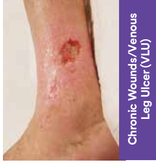
Chronic Wounds/Venous Leg Ulcer (VLU)