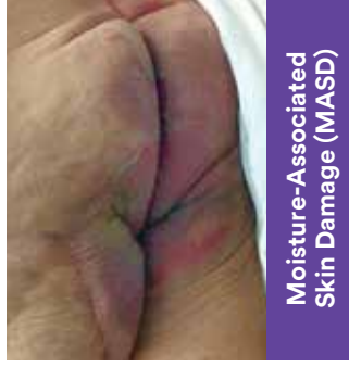
Moisture-Associated Skin Damage (MASD)